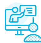
A Chance to Pitch Their Portfolio