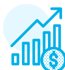
An Investing Strategy