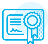
Certificate of Completion